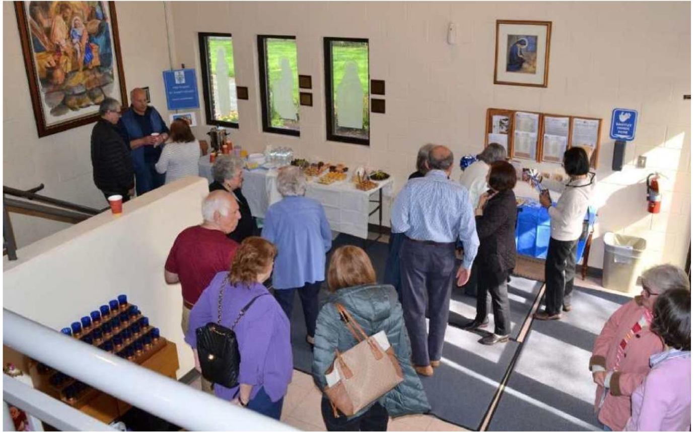
Attendees gathered for fellowship following the service.

To report abuse, please visit the website of the Archdiocese of Newark.