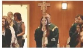
Back-to-school Masses set positive tone for new school year (Photos) September 19, 2024 In "Photos"

Academy of the Holy Angels • Archdiocese of Newark • Don Bosco Prep • Immaculate Heart Academy • St. Joseph Regional High School • Theater