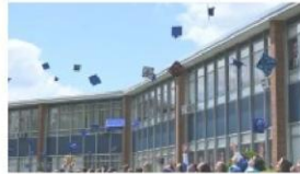
Catholic high schools celebrate Class of 2024 graduation June 18, 2024 In "Top Stories"