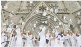
Joy on full display: Catholic high schools celebrate graduation June 21, 2022 In "Local"